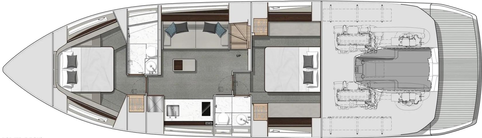
LOWER DECK* Shown with optional Saloon Ottoman, & Tender in Garage